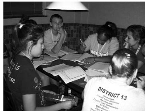
Teens working together at the Illinois Teen Institute Camp to bring alcohol and drug prevention to our community.

where teens and adults partner in a comprehensive alcohol and drug prevention program.